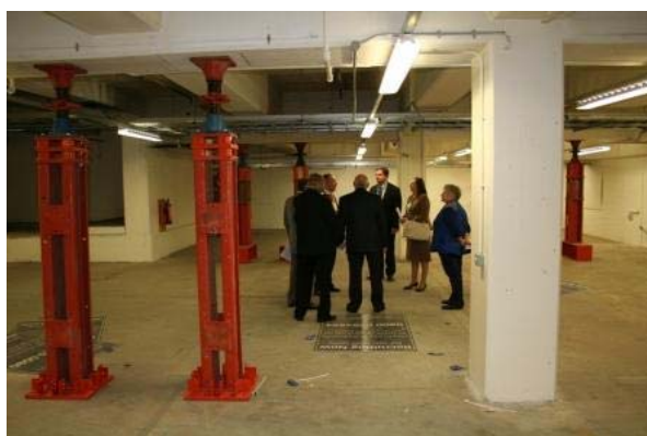
Members of the Scrutiny Board Members visiting the undercroft below Ironmonger Square

The Board had been involved with the Ironmonger Square plans since their inception and welcomed the opportunity to comment on the revised plans. The Board undertook a visit to the undercroft, which enabled them to see the structural issues. The press were also invited to visit which led to a two-page spread in the local paper showing the people of Coventry the reason for the delays in completing Ironmonger Square. The Board asked the Cabinet to consider the implications of the revised scheme and the safety of pedestrian access from West Orchards to the new square, which will be picked up in the capital programme for 2010/11.