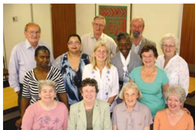
Researchers from the project

In 2007 the Board had commissioned a successful piece of work investigating the experiences of older people before and after discharge at University Hospitals Coventry and Warwickshire (UHCW) 'Learning from Experience'.